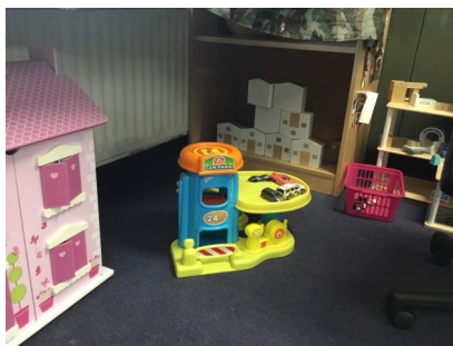
Play and imagine