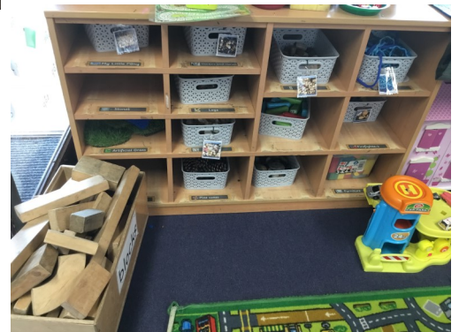
Build and create