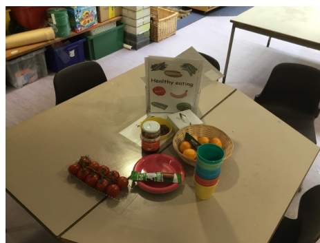
Snack and chat